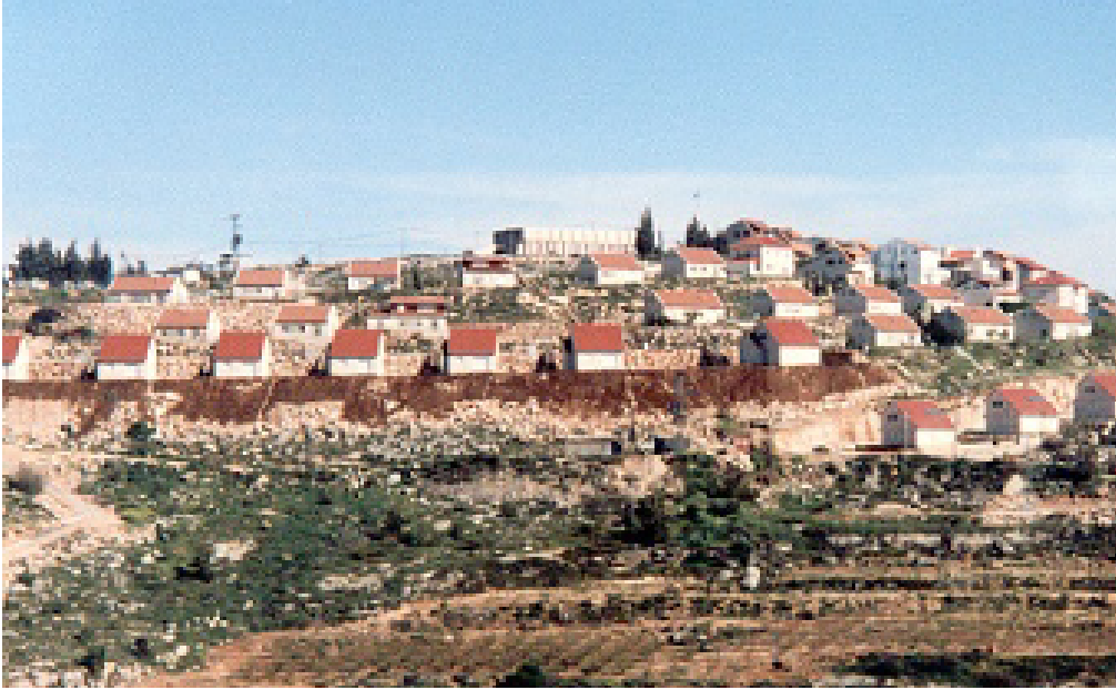
One of many Israeli Settlements in the West Bank.

• Since 1967, consecutive Israeli governments have established settlements in violation of international law to colonize the Palestinian territories in order to consolidate and secure Israeli control over these areas and prevent the emergence of a Palestinian state.